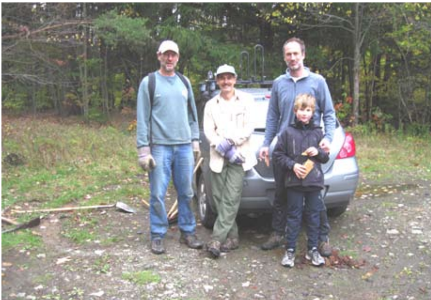
A small fraction of the work crew on Hammond Hill, Saturday, October 15th

will split these up and place them in stores, gyms, etc. around town. We might have some available at the Fall meeting for people who live outside the Ithaca area and could place them more widely.